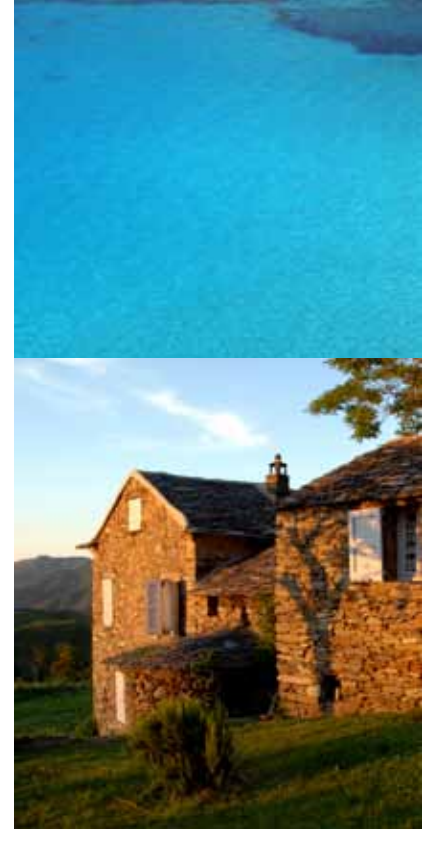
PRESS KIT CORSICA TOURIST BOARD