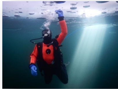
Ice diving in a frozen lake