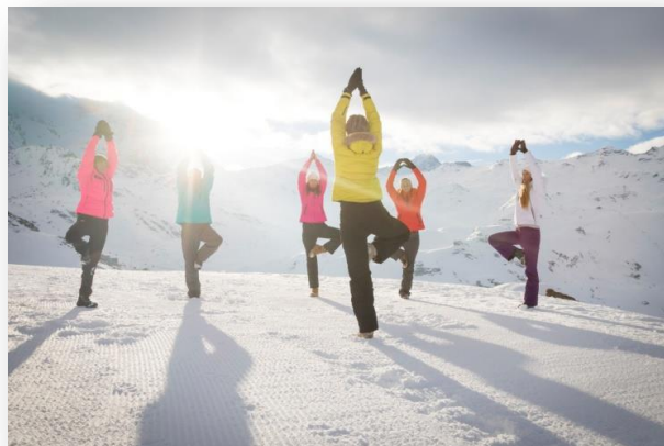
Yoga nature Wellness in the mountain