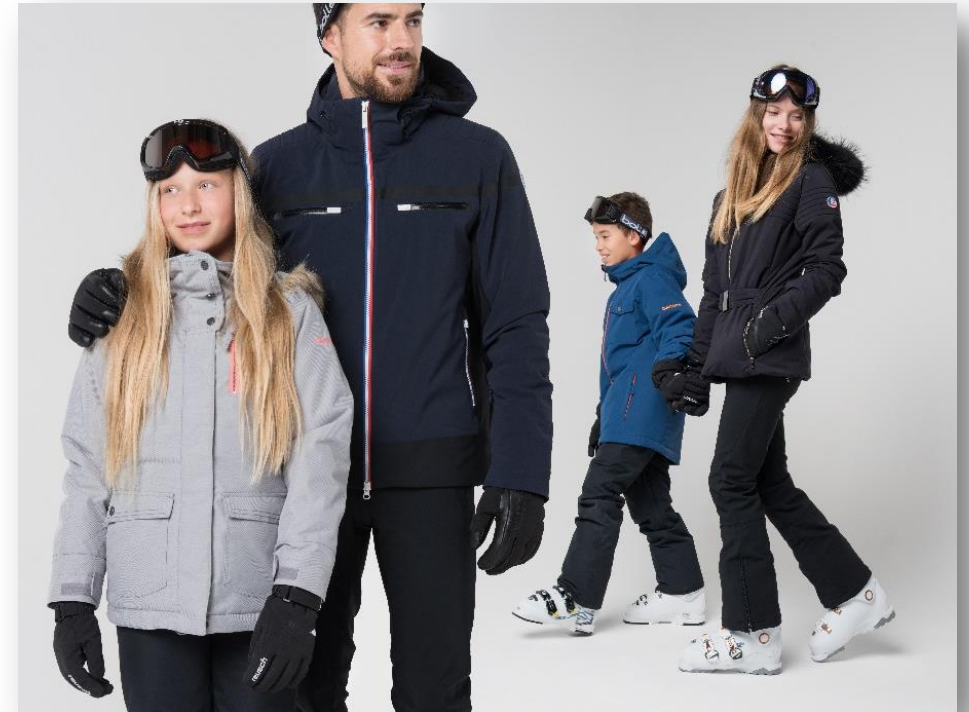
Adults and children _ Ski Chic