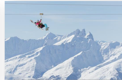
Mega Zip Line the highest in Europe