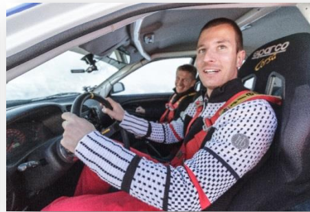
Ice driving with a kart or a car