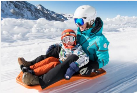
Le Toboggan 6 km of fun!